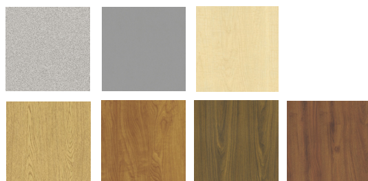
Optional Hard Plastic Top Colors: Grey Nebula, Charcoal, Maple, Oak, Cherry, Walnut, and Mahogany.

When others are long gone this very-well made in the USA product from Capitol Seating will still be vibrant and structurally sound in every way. Built better to last longer. Enjoy the peace-of-mind that comes with products designed for educational use.