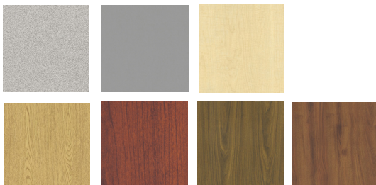
Optional Hard Plastic Top Colors: Grey Nebula, Charcoal, Maple, Oak, Cherry, Walnut, and Mahogany.