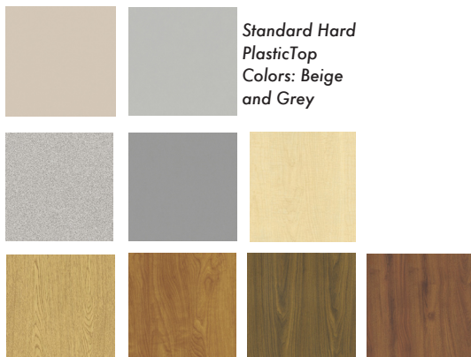
Optional Hard Plastic Top Colors: Grey Nebula, Charcoal, Maple, Oak, Cherry, Walnut, and Mahogany.